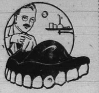
Plate and Extraction Specialist