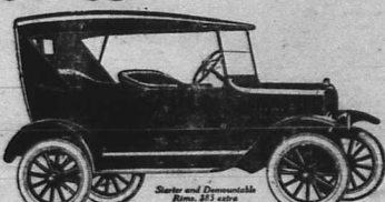
Starlet and Convertible Run, 211 cubic